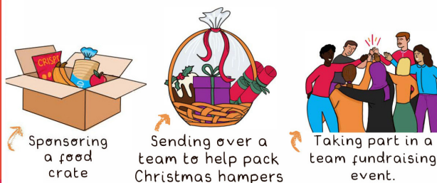
Sponsoring a food crate